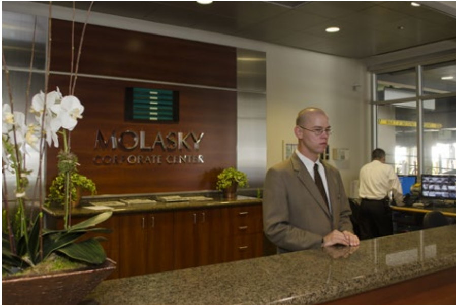
Award-winning management team