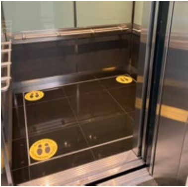
Social distancing in elevators