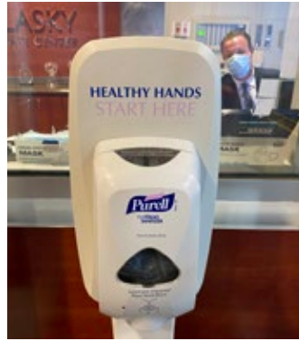
Hand sanitizer dispensers