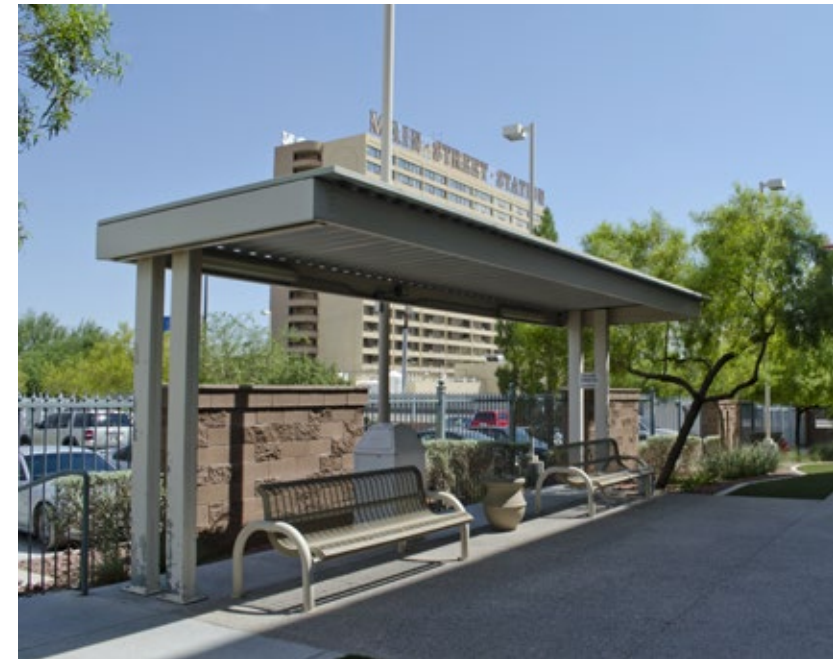
Shaded outdoor break area