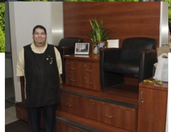
Shoe shine station