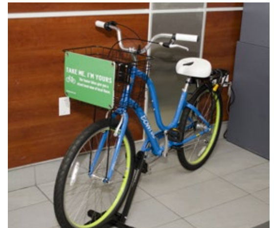
Complimentary bike-share program