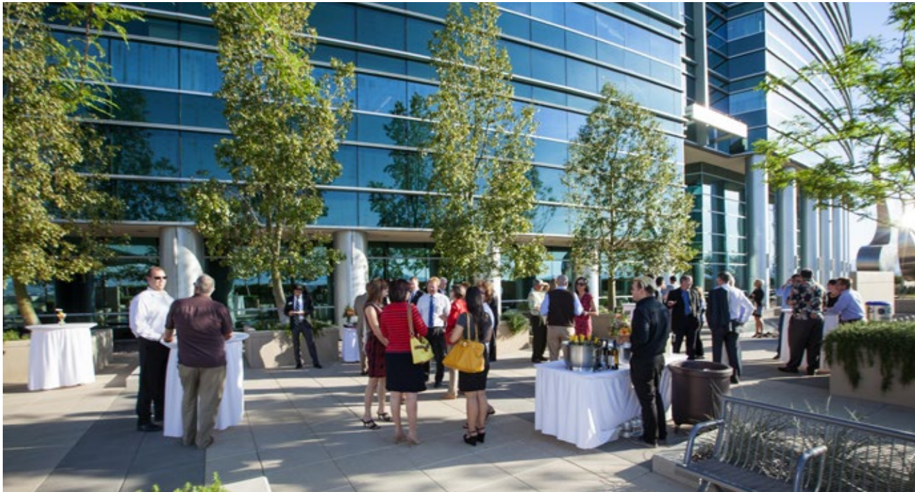
7th floor patio