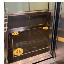
Social distancing in elevators