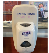
Hand sanitizer dispensers