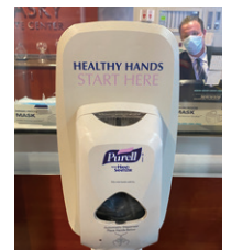
Hand sanitizer dispensers